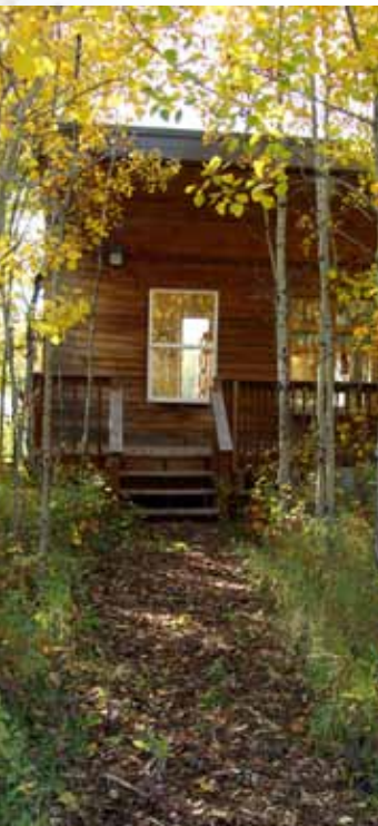
One of three overnight cabins